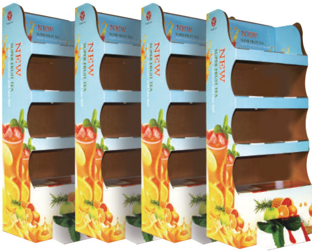
Retail ready display