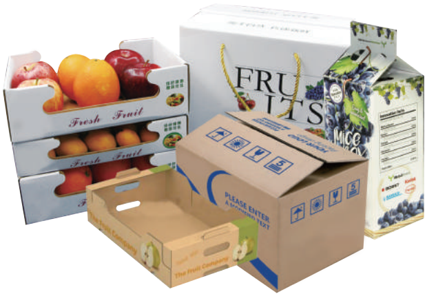
Han FullColor® Food-grade Aqueous Ink