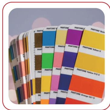
Digital printing color card

Packaging Size of the Feeding Part: 4600 mm (L) * 1900 mm (W) * 2200 mm (H)