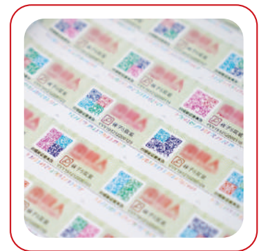
Bar code and QR code printing

Easy operation of various kinds of orders